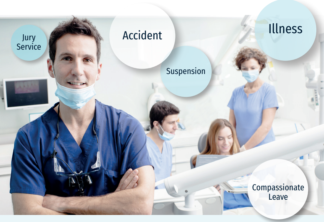
Benefits depend on the Level of Cover you select – please see back page.

An affordable monthly or yearly payment can protect your business – bringing in much needed revenue if you or one of your named key people is absent for any one of a range of reasons.